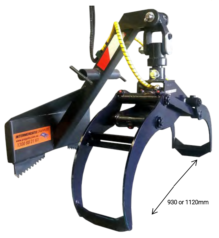
Suits all miniloaders 15-30hp