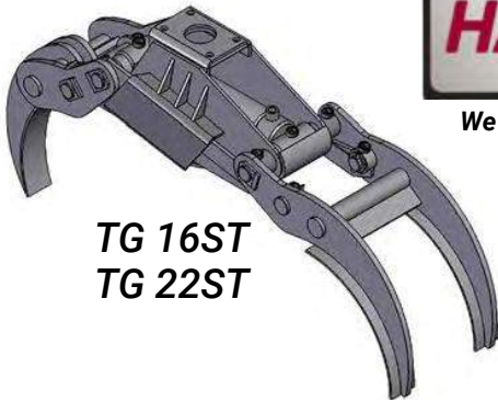
TG 16ST TG 22ST